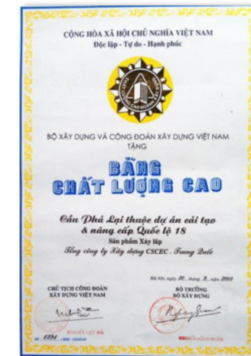
Construction Engineering High Quality Award in VN / No.18 National Highway Pha Lai Bridge