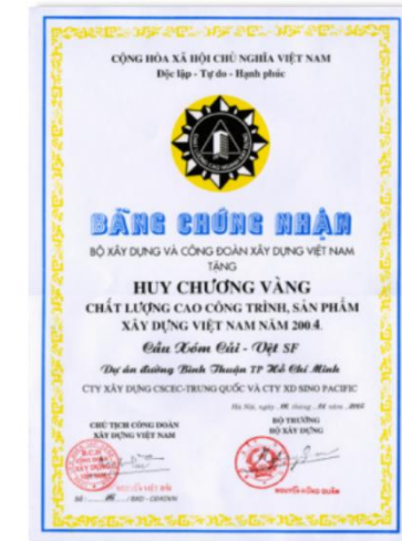
Construction Engineering Quality Gold Award in VN / Ho Chi Minh City. Nguyen Van Linh Parkway Xom Cui Bridge