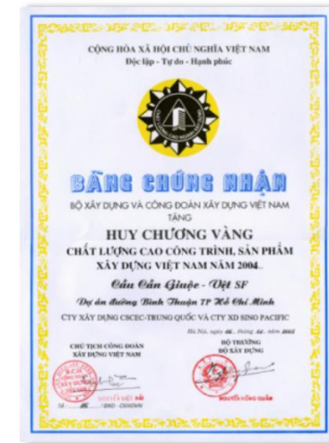
Construction Engineering Quality Gold Award in VN / Ho Chi Minh City. Nguyen Van Linh Parkway Can Giuoc Bridge