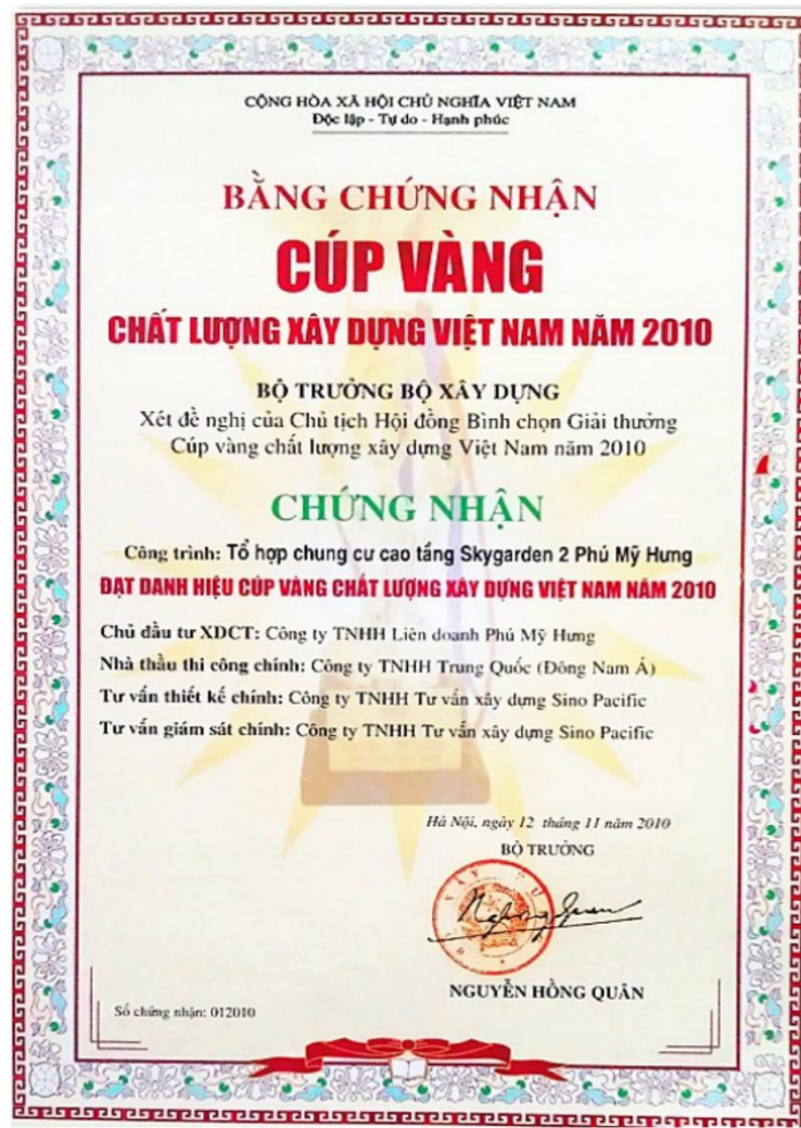
The highest award of the construction industry called "Gold Star Award" in VN National Model Residential Area