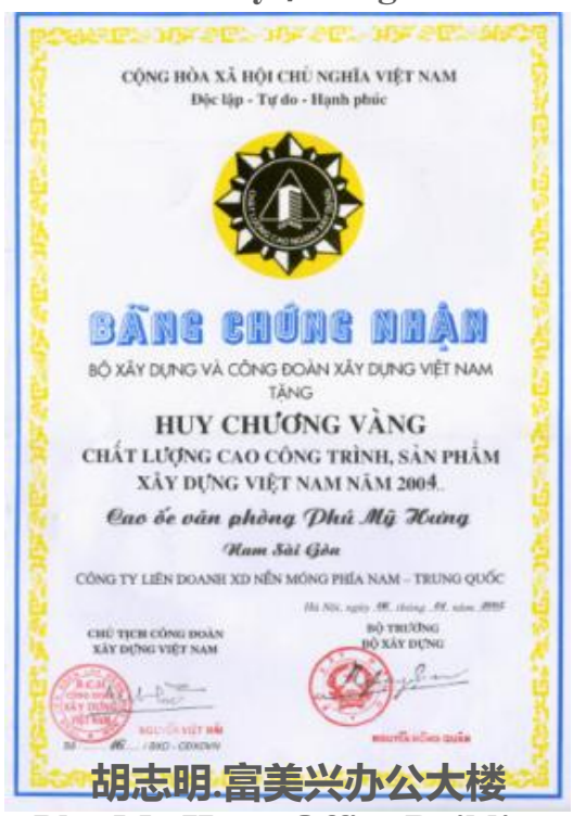
胡志明.富美兴办公大楼 Phu My Hung Office Building, HCMC