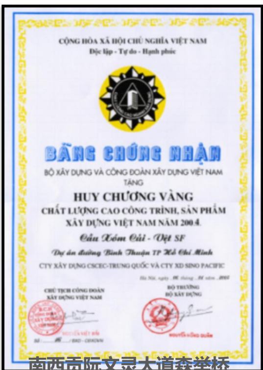
南西贡阮文灵大道森举桥 Xom Cui Bridge, Nguyen Van Linh Parkway, Saigon

公司荣获胡志明市“市长奖”，太平洋公司获得越南政府“总理奖”，多名员工获得越南国家“总理奖”、胡志明市“市长奖”、“五一”劳动奖章和越南建筑工程“质量贡献金奖”，先后有8项工程获得越南国家“工程质量金奖”。