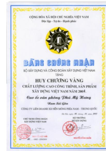
Construction Engineering Quality Gold Award in VN / Ho Chi Minh City. Lawrence S. Ting Building