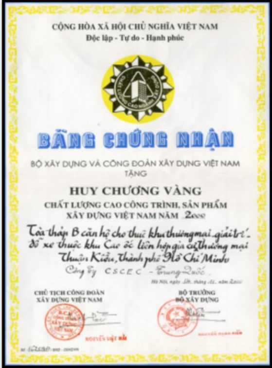
胡志明.顺桥广场 Thuan Kieu Plaza, HCMC