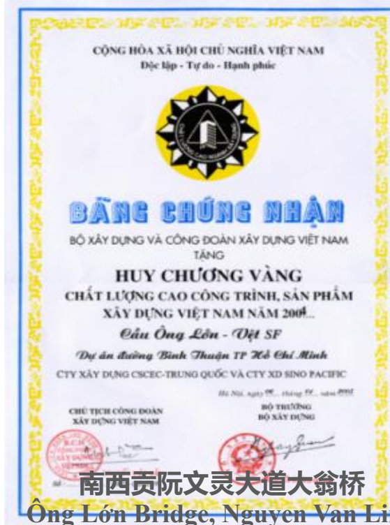
南西贡阮文灵大道大翁桥 Ông Lớn Bridge, Nguyen Van Linh Parkway, Saigon South

公司荣获胡志明市“市长奖”，太平洋公司获得越南政府“总理奖”，多名员工获得越南国家“总理奖”、胡志明市“市长奖”、“五一”劳动奖章和越南建筑工程“质量贡献金奖”，先后有8项工程获得越南国家“工程质量金奖”。