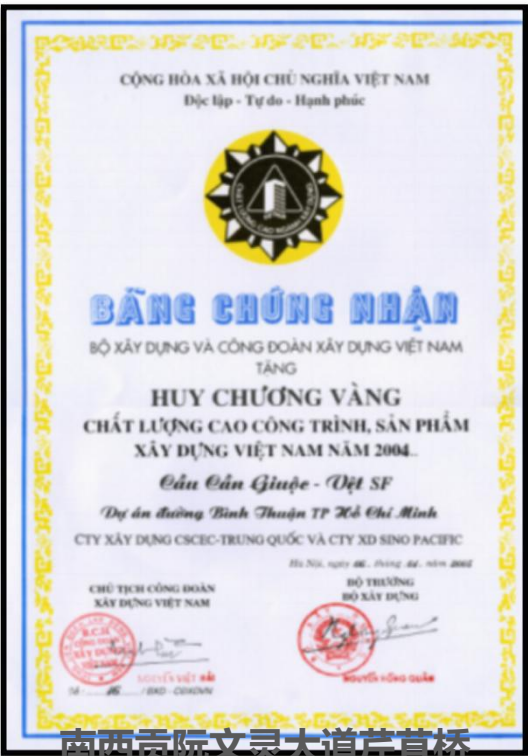
南西贡阮文灵大道岸直桥 Cần Thơ Bridge, Nguyen Van Linh Parkway, Saigon South