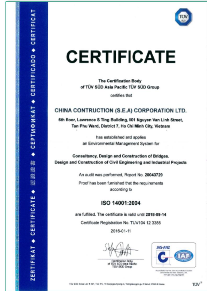
ISO 14001:2004 Environmental Management System