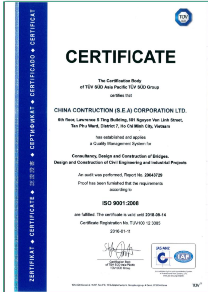
ISO 9001:2008 Quality Management System