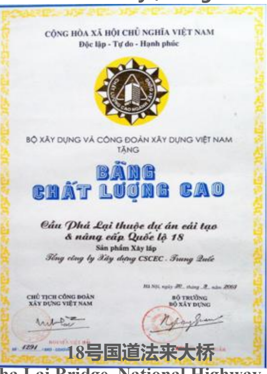
18号国道法来大桥 Pha Lai Bridge, National Highway No. 18

The company was awarded “Mayor Award of Ho Chi Minh City”, SPCC was awarded “Premier Award of Vietnam”. Our staff were awarded “Premier Award of Vietnam”, “Mayor Award of Ho Chi Minh City”, “Merit of International Labor Day”, “Quality Contribution Golden Medal”. 8 projects were awarded "High Quality Building for National Golden Medal“.