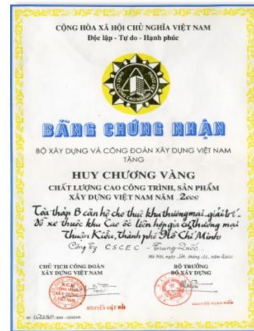
Construction Engineering Quality Gold Award in VN / Ho Chi Minh City. Thuan Kieu Plaza