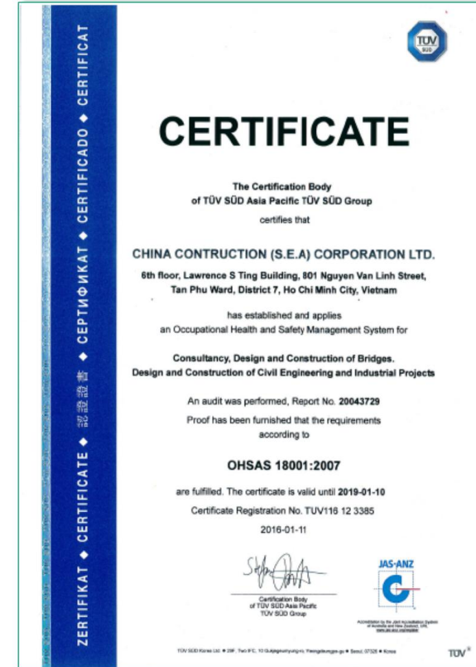
OHSAS 18001:2007 Occupational Health and Safety Management System