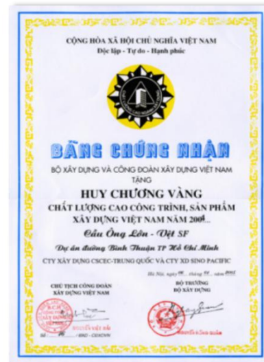
Construction Engineering Quality Gold Award in VN / Ho Chi Minh City. Nguyen Van Linh Parkway Ông Lớn Bridge